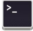
Tilix Linux shell