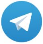
Telegram Messaging (requires existing account)