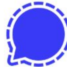
Signal Messaging (coming soon)