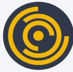
Maltego Graph analysis