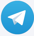
Telegram Messaging (requires existing account)