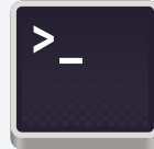
Tilix Linux shell (coming soon)