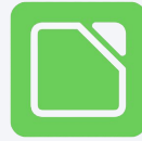
LibreOffice Docs & Spreadsheets