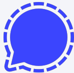
Signal Messaging (coming soon)